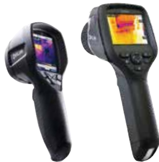
The "b" Series Infrared Camera helps speed up diagnostic work, especially when used with a Blower Door.