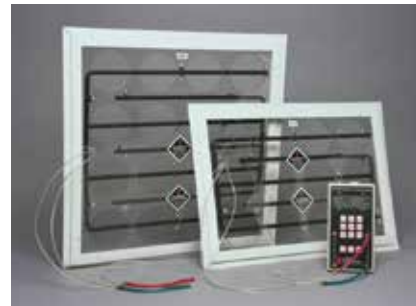
The TrueFlow® Air Handler Flow Meter, shown with DG-700, is used to measure the total amount of air moving through an air handler.