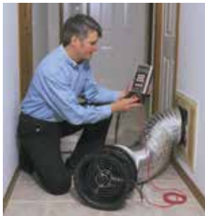
The Minneapolis Duct Blaster® is used to measure the airtightness of ductwork.

Minneapolis Blower Door™ and TECTITE™ are trademarks of The Energy Conservatory. Duct Blaster® and TrueFlow® are registered trademarks of The Energy Conservatory.