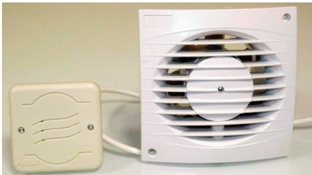
RADOSTAT TM high performance radon mitigation technology, integrated into existing building design.

RADOSTAT TM is the first instrument to pilot any active ventilation system for radon elimination. It constantly monitors indoor air for the presence of radon and activates the ventilation system to prevent exposure to excessive concentrations beyond 150 Bq/m 3 . The RADOSTAT TM also creates an effective anti-radon barrier in a dwelling by putting rooms in a slightly positive pressure, keeping radon gas out.