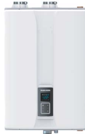
Sleek Design - Compatible with 2" PVC Vent