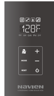
INCLUDED Illuminated Front Panel with Advanced Hydronic Operation